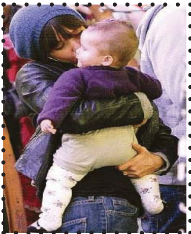
Jessica Alba BabyLegs®

BopStarBaby puts product on all the right people! Here are a few recent sightings: